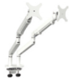
Dual monitor arm