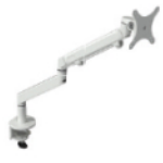
Single monitor arm